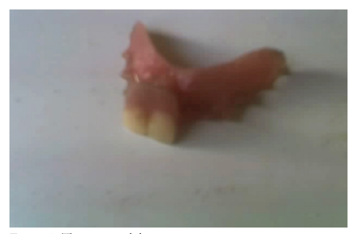
Figure 2: The extracted denture.

benign and showed evidence of inflammatory cells. The patient was discharged home on the 25th postoperative day with a radiologically sealed BOF and jejunostomy site. He has remained symptom free at 3 years of follow up, weight (84.6 kg, BMI= 26.7).