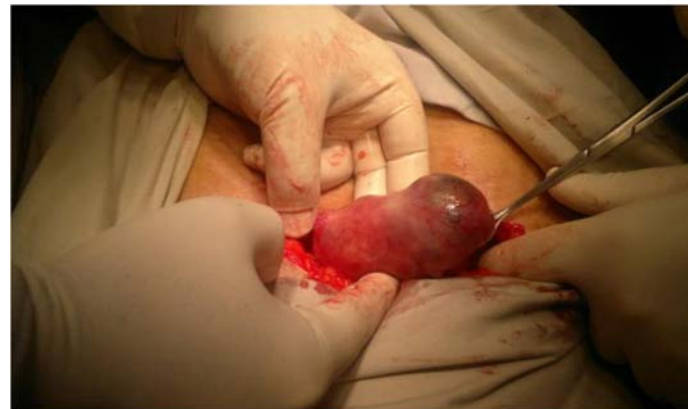
Figure 1: Laparotomy revealing a left intact, tense and shiny cornual mass.

On vaginal examination, the cervix was closed with no vaginal bleeding. Cervical excitation was also negative, but there was tenderness on the left lower abdomen on bimanual examination. By transvaginal ultrasound examination, there was a bulky empty uterus with a 3.8 × 4 cm hypoechoic lesion in the left part of the uterine fundus with internal echogenic line and rim of hypoechoic fluid; no free fluid was detected in the Douglas pouch.