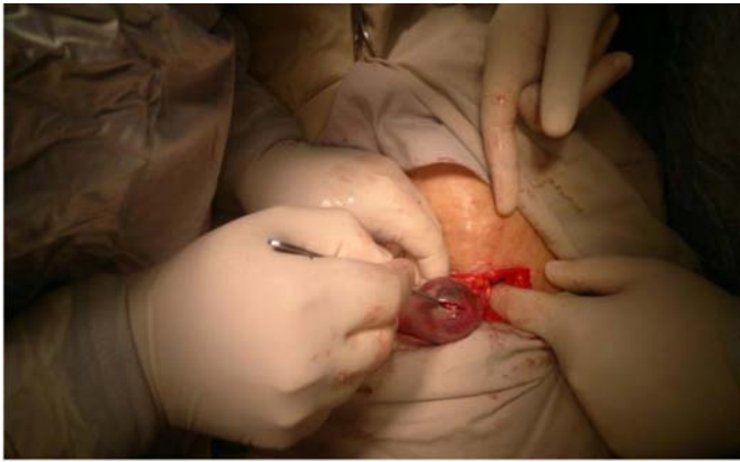
Figure 2: Evacuation of tubal contents through a longitudinal incision along the tube.

The pedicle was sutured with 0-Vicryl (Fig. 3), and hemostasis was secured. The specimens were then sent for histopathology.