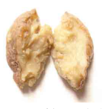
Figure 1: Gross cut section of skin covered well circumscribed creamish white gelatinous tissue piece.

Gross specimen comprised a single, well-circumscribed, skin-covered, creamish white tissue piece measuring 2 \times 1.8 \times 1.4 cm and appeared gelatinous on cut section. (Fig. 1)