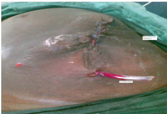
Figure 3: Patient with umbilical hernia immediately after surgery. Note the reconstructed umbilicus