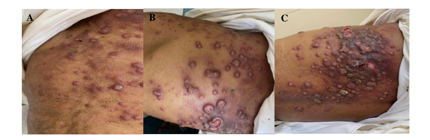
Figure 1: Clinical photographs of the torso of a 71-year-old man with (a) multiple hard nodules with a left-side dermatomal distribution along T4–T6, not crossing the midline, and (b and c) ulcerating nodules with a central crater-like appearance and healthy-looking granulation tissue, without any evidence of discharge or active infection.

Prior to presentation, the patient reported being seen at a local health center, wherein he was diagnosed with HZ and received a seven-day course of 1,000 mg of valacyclovir three times daily, with no improvement. A skin biopsy of one of the ulcerative nodules showed invasive nets and sheets of oval-to-polygonal cells separated by collagen, with a few squamous pearls and evidence of single-cell keratinization [Figures 2A and B]. In addition, the cells stained positive for p63 and epithelial membrane antigen [Figure 2C]. As a result, the patient was diagnosed with cutaneous metastasis of the primary SCC; unfortunately, he deteriorated quickly before medication could be initiated and died within a month of diagnosis.