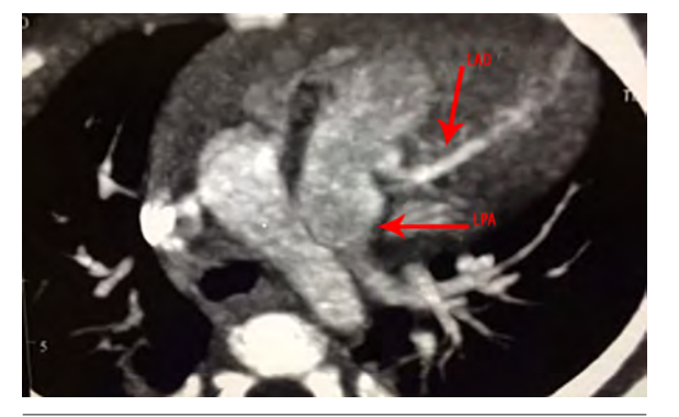
Figure 1: A multidetector CT image shows the anomalous origin of the left coronary artery from the pulmonary trunk, which extends into the interventricular groove as a left anterior descending artery (LAD). The left pulmonary artery (LPA) is indicated.

pressure and saturation in pulmonary and systemic circulations are equal. Therefore, the flow in the LCA is antegrade with relatively saturated blood.<sup>2</sup> At birth, the infant is asymptomatic but during the early months of life the pulmonary pressure falls below systemic pressure, which results in left-to-right shunt from the higher pressure left coronary arterial system to the lower pressure pulmonary arterial system. This is known as the coronary steal phenomenon.<sup>3</sup> Circulatory insufficiency, myocardial infarction, and life-threatening cardiac dysrhythmias are the most common clinical presentations during infancy.<sup>2,3</sup> Older patients carry the risk of sudden death due to myocardial infarction, left ventricular dysfunction and mitral regurgitation, or silent myocardial ischemia.<sup>2-4</sup>