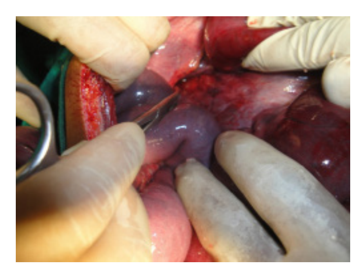
Figure 2: Operative photograph of the patient showing diaphragmatic rupture and pregangrenous condition of bowel loops.