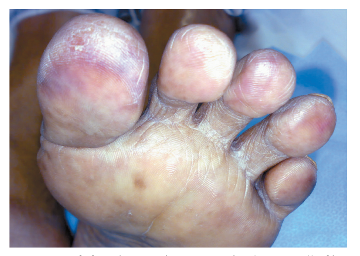
Figure 2: Left foot showing the cyanotic skin lesion in all of his toes

The lab reports revealed significant eosinophilia. On reviewing his previous CT scan of abdomen there were circumferential soft tissue plaques involving mainly the infrarenal abdominal aorta. (Fig. 3)