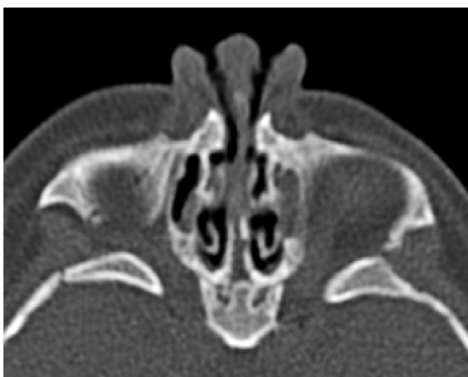
Figure 3: Postoperative CT scan showing patent pyriform aperture.

Surgical management of CNPAS includes dilation and stenting or through a sub labial approach to the premaxilla depending upon the extent of stenosis. In our case, nasal obstruction also was relieved by gradual dilatation by boogies and stenting as the nasal bone in neonatal period is soft and can be dialted. 15 The narrowed nasal aperture can be enlarged by drilling out the nasal process of the maxilla with diamond burrs and dissection instruments. To allow the nasal mucosa to become attached to the new bony margins and to avoid recurrent stenosis nasal, stents are left in place for at least 7 days or longer. 3