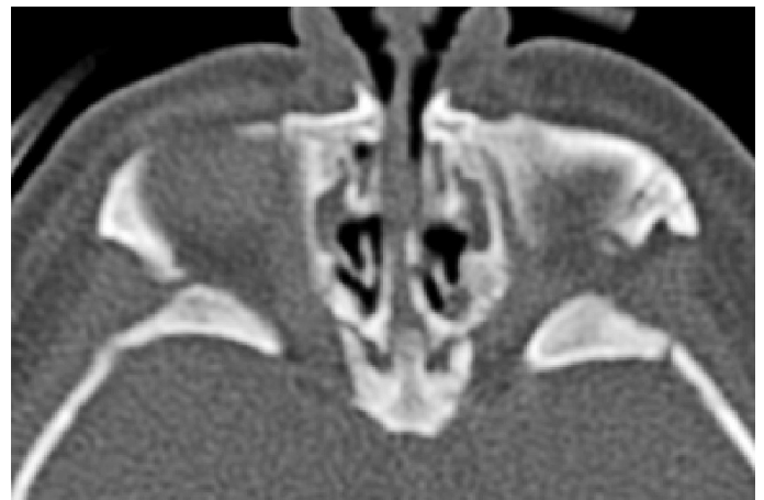
Figure 1: Preoperative CT scan showing narrowing of pyriform aperture.

ears, small chin, high arched palate and the cry was also very weak. The external nasal pyramid and nasal vestibular opening were normal and there was marked decrease in mist formation on spatula test bilaterally suggesting obstruction. There was marked nasal obstruction and it was not possible to pass nasogastric tube through both nostrils for feeding. All the cranial nerves were normal on examination and there was central hypotonia with preserved deep tendon reflexes. There was no coloboma of eye and the cardiovascular examination was normal. There was no ear anomaly. Deafness and throat examination was normal. The neonate underwent complete pituitary hormonal assay which was found to be normal. Other investigations like chest X-ray, ECG, Echocardiogram and Brain CT were also normal. The CT scan of the Nose and paranasal sinuses revealed narrow anterior nasal inlet and bony overgrowth of maxillary nasal process suggestive of congenital nasal pyriform apertea stenosis ( figure 1and 2).