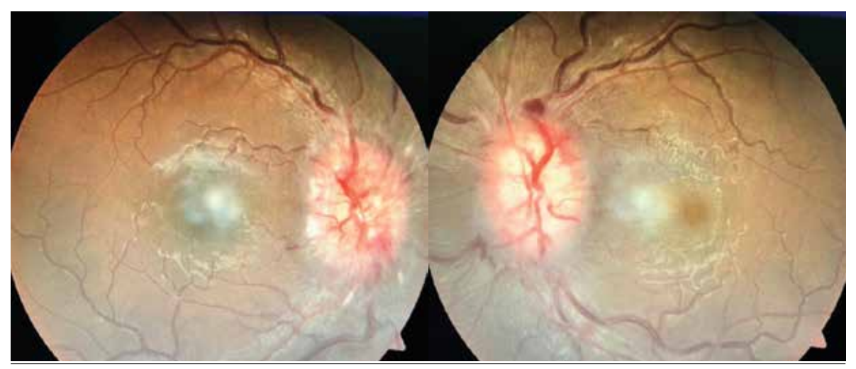
Figure 2: Fundoscopy showing bilateral papilledema, suggestive of 2<sup>nd</sup> cranial nerve palsy.

During her hospital stay, the patient showed dramatic improvement in headache and in palsies of the 7<sup>th</sup>, 9<sup>th</sup>, and 10<sup>th</sup> CNs. At a six-month routine