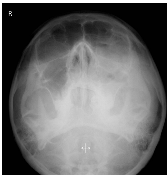
Figure 1: Water's view for nasal sinuses of a 31-year-old man presenting with left facial discomfort.

Besides, the CT scan demonstrated a generalized mucosal thickening of nasal turbinates in both