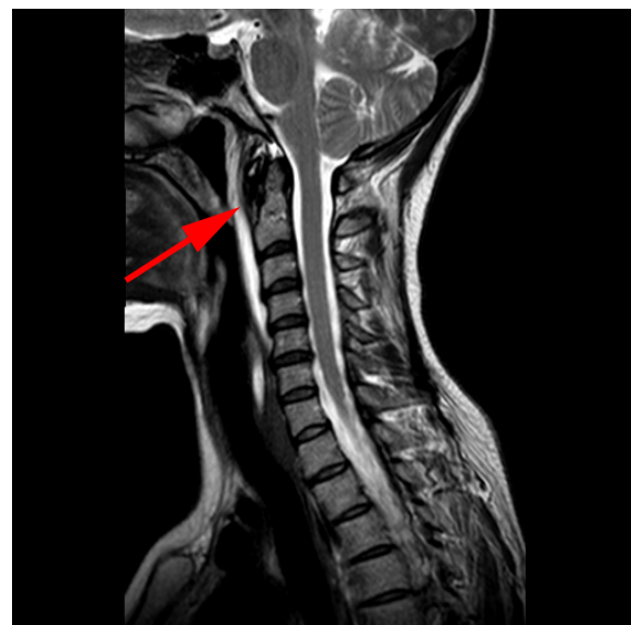
Figure 2: Sagittal T2-weighted magnetic resonance imaging scan of the neck.