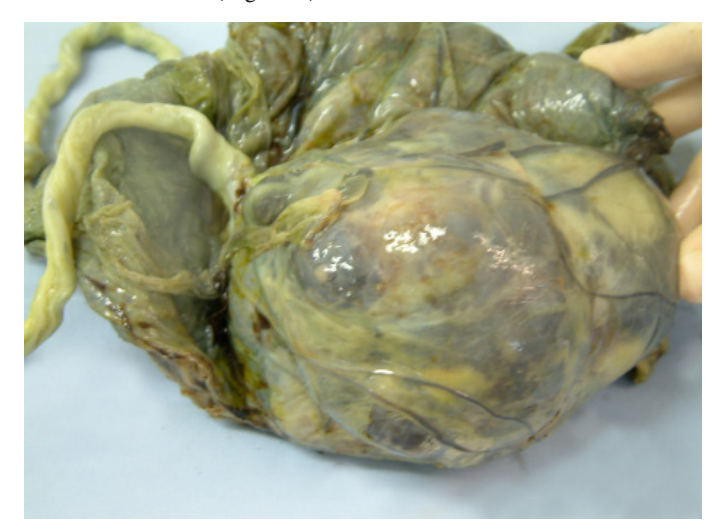
Figure 1: Placental disc with the bosselated brownish mass on the fetal surface.

19 \times 18 \times 3 cm, umbilical cord measuring 55 cm in length and fetal membranes. The placenta had a smooth, brownish bosselated mass measuring 13 \times 12 \times 6 cm centrally close to the cord insertion on the fetal surface. (Figure 1) The mass comprised solid nodular brownish areas and blood filled spongy areas separated by bands of fibrous tissue.(Figure 2) Histology confirmed a chorangioma with areas of ischaemic necrosis.(Figure 3)