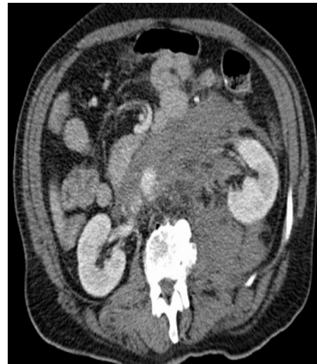
Figure 2: An axial CT scan view