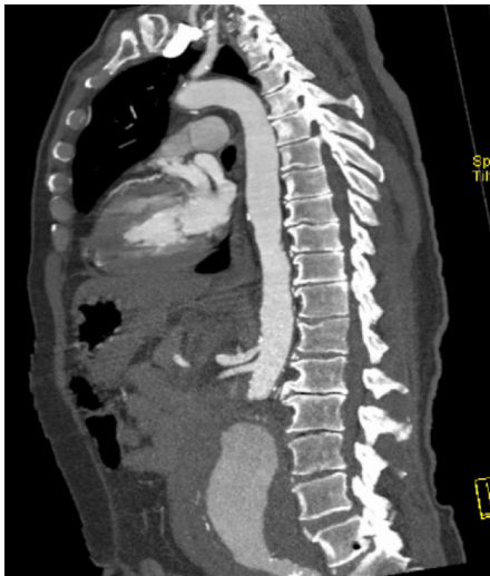
Figure 1: A sagittal CT scan view

On physical examination, the patient was drowsy with a heart rate of 70 beats per minute and blood pressure of 60/30 mmHg. The abdomen was distended with mild tenderness. No pulsatile abdominal mass was felt and no audible abdominal bruit was heard. Femoral and distal pulses were palpable. Both his feet were cold to touch. An urgent CT scan with intravenous contrast was done.