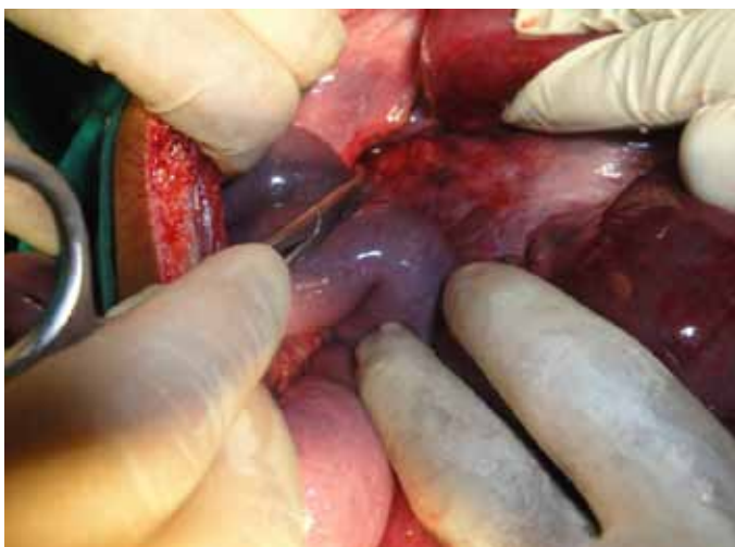
Figure 2: Operative photograph of the patient showing diaphragmatic rupture and pregangrenous condition of bowel loops.