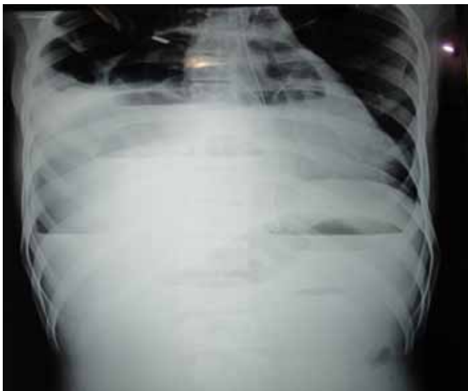
Figure 1: Radiograph of the patient showing right side diaphragmatic hernia with multiple air fluid levels in small intestine suggestive of Acute Intestinal Obstruction.

Recognition of a traumatic diaphragmatic hernia in the immediate post-traumatic period is difficult, due to associated injuries and to the fact that several radiological features suggestive of hernia may mimic those of chest injuries. A careful history, examination, and awareness of the possibility of the condition and its complications are essential if these patients are to be managed successfully.