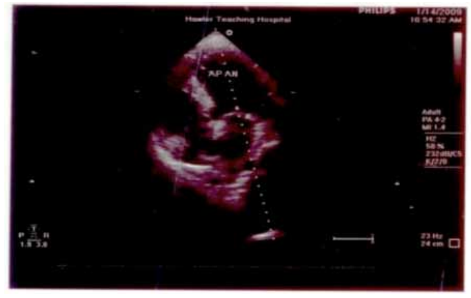
Figure 2: Apical four-chamber view recorded 36 hours after anterior-ST-segment elevation myocardial infarction. Note early left ventricular infarct expansion. (AP A N=Left ventricular infarct expansion) [From Erbil (Hawler) Teaching Hospital Echocardiographic Department].

No significant difference was noted in the incidence of early left ventricular infarct expansion between males (18.67%) and females (15.38%; p=0.7). (Table 1)