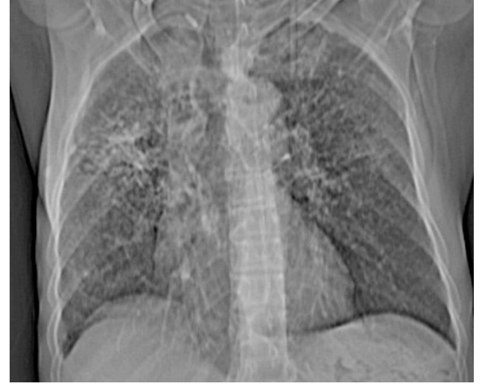
Figure 1 : Chest X-ray (PA)-shows reticulonodular opacity in right perihilar region.

The diagnosis is established most securely when clinicoradiologic findings are supported by histologic evidence of widespread non-caseating granulomas.<sup>1</sup> Recently, adding to the diagnostic difficulty, there are also several reports of coexistence of sarcoidosis and tuberculosis in the same patients.<sup>3</sup>