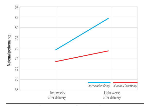
Figure 3: Changes in mothers' performance scores in the intervention and standard care groups two and eight weeks after delivery.