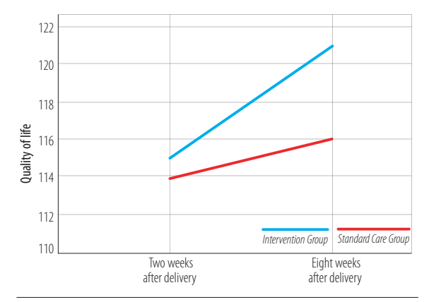
Figure 2: Changes in quality of life scores of the intervention and standard care groups in the two and eight weeks after delivery.

*Independent t-test; **Repeated measures analysis of variance.