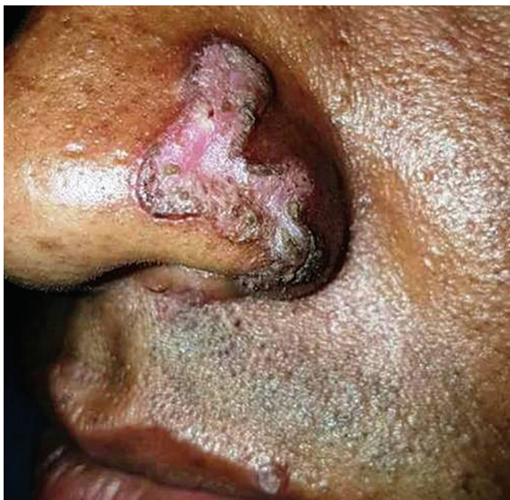
Figure 1: Clinical picture of the lesion.