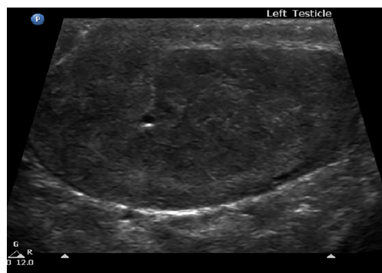
Figure 1: Ultrasound of the left testicle showing hyperechoic areas.