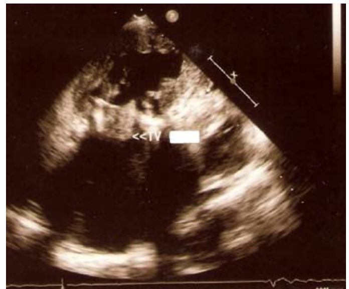
Figure 2: Transthoracic Echocardiogram (TTE)