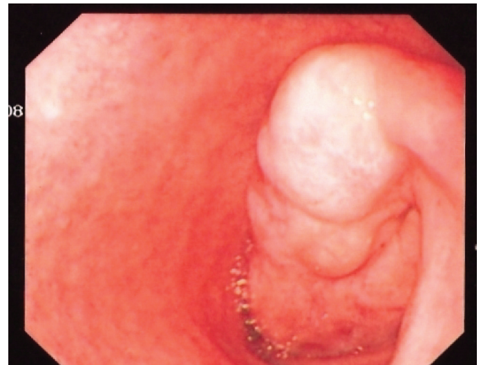
Figure 2: Endoscopic view of brunneroma

A 56 yr old female patient presented with features of on-and-off vomiting especially with solid food. She was very much at ease with liquid food. She had treatment with antacids and h2-blockers. Her symptoms of vomiting worsened. Her vital signs were normal. The blood parameters were within normal limits. The physical examination revealed no remarkable findings. The abdomen was soft. Upper endoscopy was planned to evaluate the sgastric outlet obstruction. Upper Endoscopy revealed a suspicious lesion in the duodenum with lobulated red colour tumor with smooth surface. Biopsy was not confirmatory and MDCT-Scan was planned. The CT-Scan with contrast showed a well defined large, smooth intraluminal hypodense lesion in the duodenum Occupying the 2 nd and 3 rd parts. (Figs. 1,2,3)