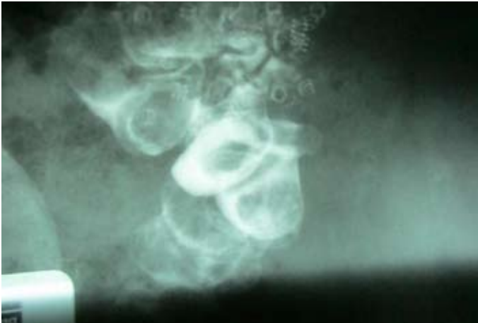
Figure 2: Further injection of dye filling the ascending colon

A barium enema did not show the fistulous tract or a leak or any irregularity.