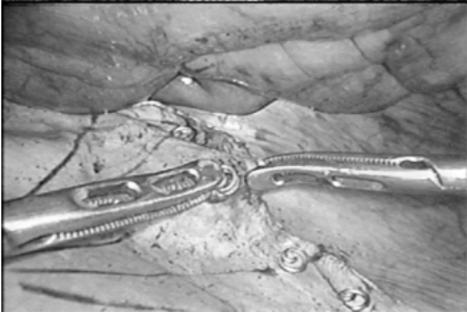
Figure 7: A loose spiral tacker being removed