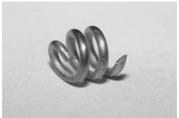
Figure 6: Spiral tacker used for intraperitoneal fixation of mesh in laparoscopic repair of ventral and incisional hernia