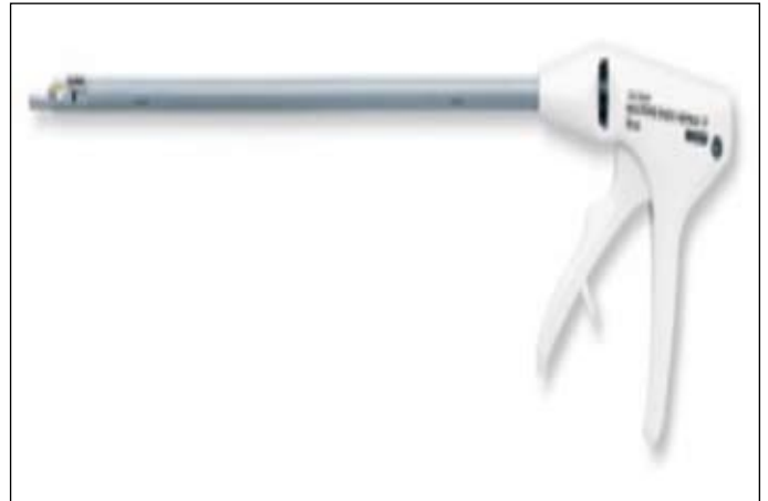
Figure 4: Helica (Spiral) tacker fixation device