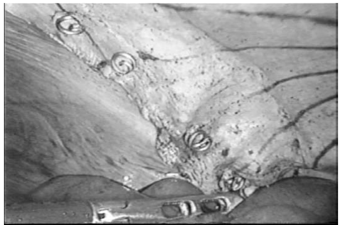
Figure 5: Intraperitoneal sharp protruding end of the spiral tacker