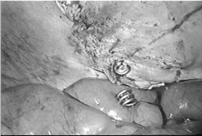
Figure 8: A loose spiral tacker lying on the intestines

length of a tacker is 4 mm long and depending on the thickness of tissue it may penetrate the neighboring structures with disastrous complications. If not carefully fixed these tackers could fall into the abdominal cavity or the sharp end of a tacker which is not buried properly may cause injury over a time even with normal patient movement (Figure 5, 6, 7, 8). Alternative techniques of suture fixation of mesh may avoid the tacker related complications. 5