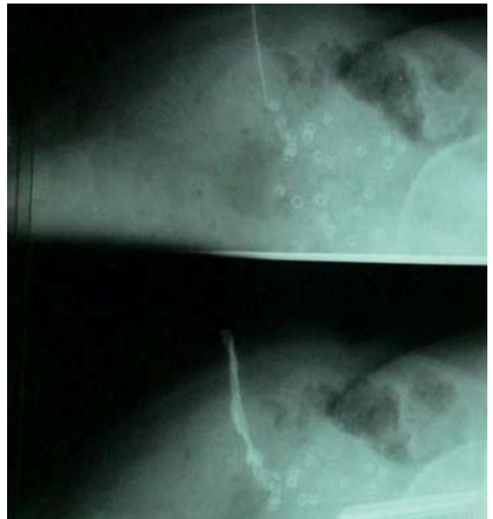
Figure 1: Sinogram showing the fistulous tract leading to the tacker. Multiple tackers are seen at the site of fixation of mesh

times a day in the hope of salvaging the mesh. Over the course of weeks the wound healed slowly except for a persistent sinus in the middle of the wound which continued to discharge offensive pus which on culture grew intestinal organisms. Infection of the mesh was suspected and the possibility of its removal was discussed with patient. A sinogram performed through the sinus opening showed the contrast tracking to the site of a tacker and on further injection it filled a part of the proximal transverse colon. A tacker had eroded into the colon resulting in a fistula (Figure 1, 2).